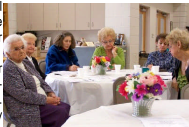
Every follows along as the proposed 2011 is discussed.

The Operating Income for 2010 was $142,174.24 compared to $122,566.35 for 2009. Restricted income (money restricted to purpose of donation) was $38,534.25. Only $13,910 was donated for the parking lot project. The Total