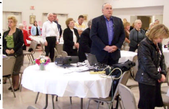
The Annual Meeting opens with the singing of "O Heavenly King."