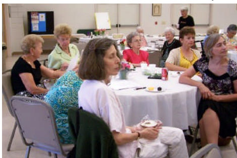
Parishioners carefully listened and followed along as the financial report was presented.

The main topics of discussion were the financial state of the church and the ongoing parking lot project. During the summer, attendance is low, and donations decrease. Unfortunately, our utilities bills tend to increase at this time of year