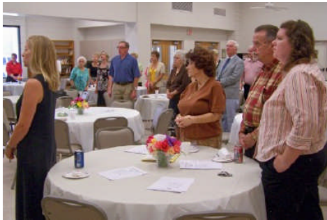
The semi-annual meeting is opened with a prayer.