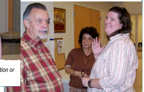
Meeting over . . . A chance to catch up with friends.

The meeting ending with a prayer, and the singing of Memory Eternal for departed church member, and Many Years for current members.