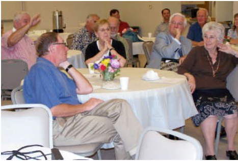
Discussion ensued regarding the financial report and parking lot project.